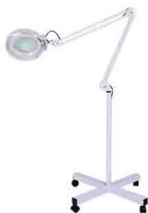
Flex Magnifier Light(Optional)

Automatic flushing device, slightly right-side slope worktable, easy to waste discharge and cleaning.